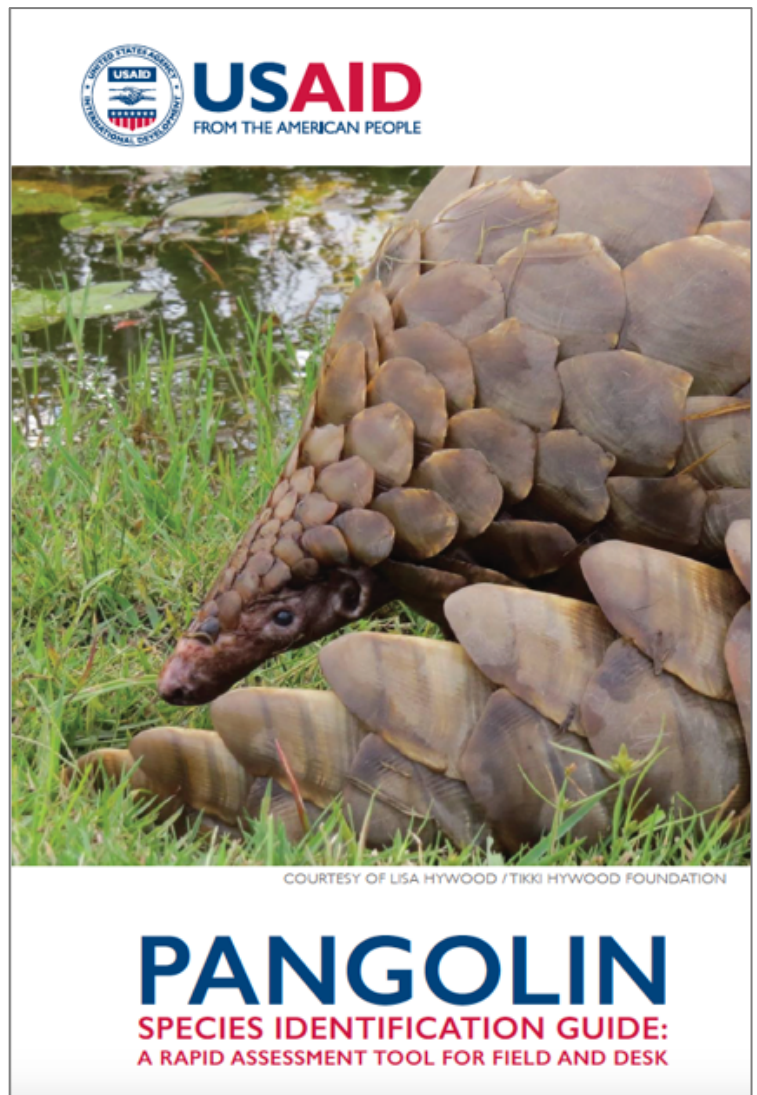
Pangolin Species Identification Guide cover

www.usaidwildlifeasia.org/pangolin-guide